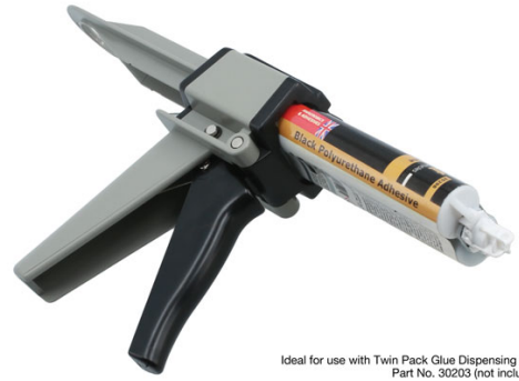
Ideal for use with Twin Pack Glue Dispensing Gun, Part No. 30203 (not included)