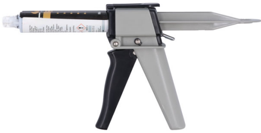
Ideal for use with Twin Pack Glue Dispensing Gun, Part No. 30203 (not included)