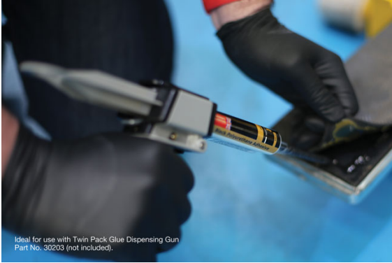
Ideal for use with Twin Pack Glue Dispensing Gun, Part No. 30203 (not included).