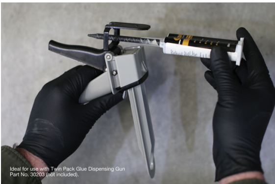
Ideal for use with Twin Pack Glue Dispensing Gun, Part No. 30203 (not included).